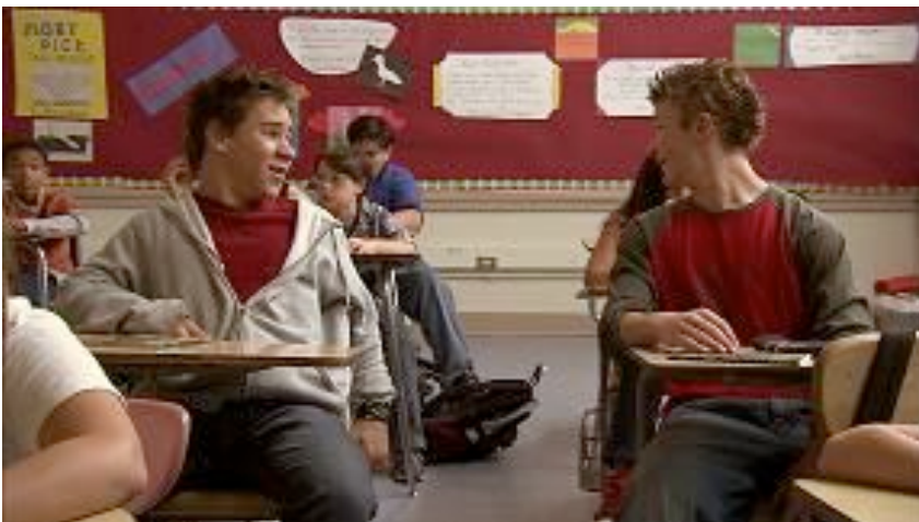
A scene from the classroom