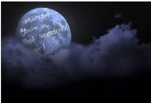
The special FX moon shot from the film