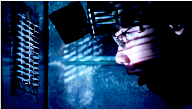
Henry inside the air duct